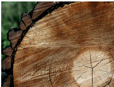
Quis. Dui bla faccumsan ve